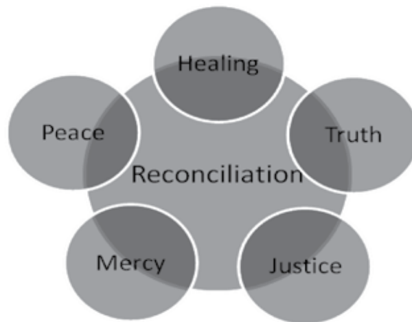
Figure 1: Integrated Components of Reconciliation

In this environment judicial mechanisms such as truth commissions and political instruments such as devolution of power would be ineffective as means of reconciliation. Objective mapping of ground realities is required to initiate the reconciliation process. In this regard, two perceptions presently prevailing among the Tamil people should be given due attention: (a) it is a Sinhalese Army (b) post-war Jaffna is an 'Occupied Territory'. As long as these perceptions are perpetuated among Tamil people it would be difficult to reach national reconciliation. Therefore, practical and effective steps need to be taken to remove these perceptions and to convince them otherwise. In the real sense of the term, reconciliation is a broader and deeper process. As Onigu Otite states it aims to replace suspicion, hatred, animosity, stereotypes, and fear with comprehension, consciousness, sympathy, possibly forgiveness, and in rare cases, compassion. In a broad sense, Otite writes, "openness to change, flexibility, the ability to peacefully modify approaches and learn from process is what conflict transformation is all about" (1999: 10).